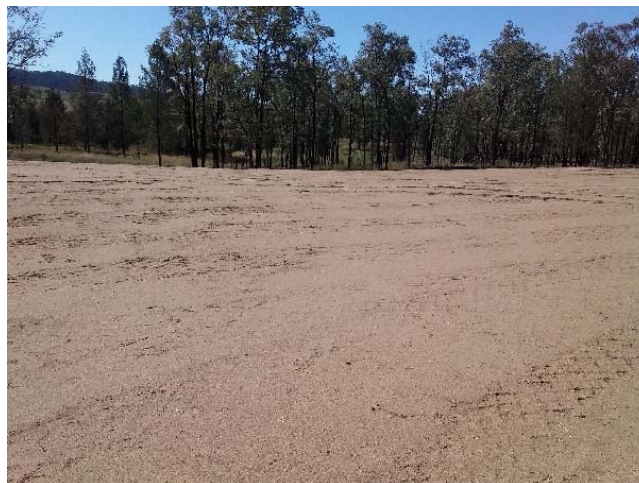
Sheepstation Creek Rd site