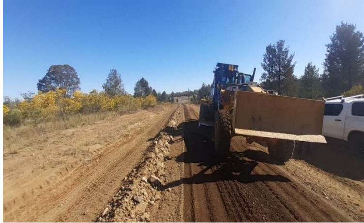
SR74 Kurrajong Hills Rd, Resheeting