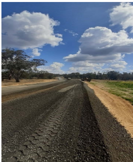
North Star Road – Flaggy, Subbase

Earthworks stabilisation has been completed and gravel has been carted for the subbase for the North Star Road Repair Project. This 1.7km project rehabilitates a section of North Star Road with inadequate width and significant pavement failure. Subgrade investigation revealed significant moisture and plasticity issues with the underlying basalt clay, which was addressed by blending with lime and sandstone.