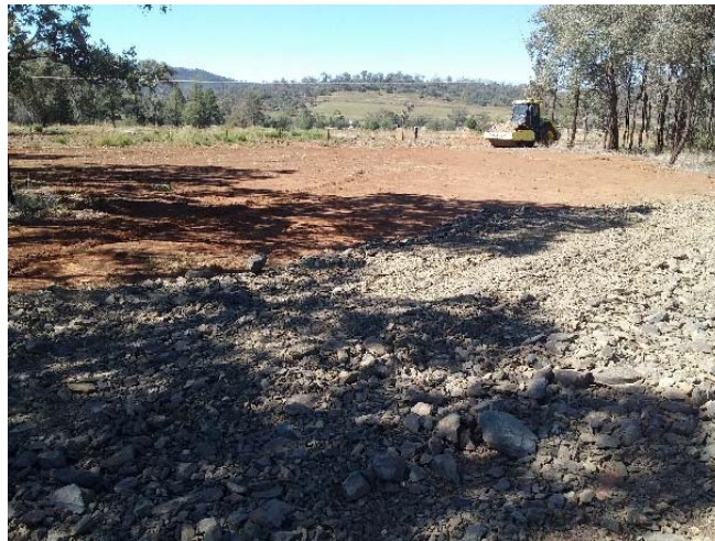
Delungra Road – Allan Cunningham Way Site

Work has commenced on two grant funded rest stops near Bingara, located at the intersection of Delungra Rd and Allan Cunningham Way and the intersection of Delungra Rd and Sheepstation Ck Road. Both rest stops will feature toilet facilities and covered picnic tables and form a part of the Big River Dreaming project.