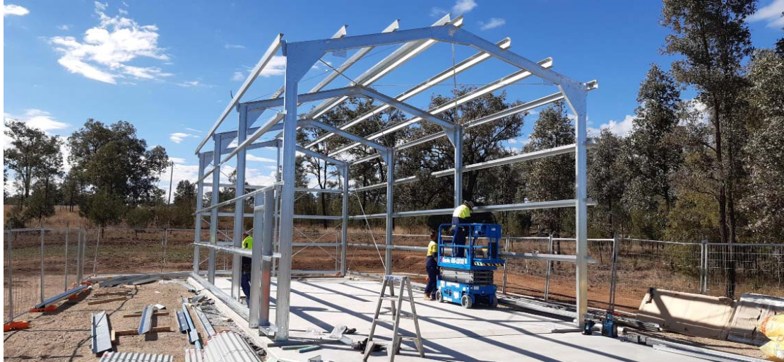
Construction of the Gineroi RFS Shed