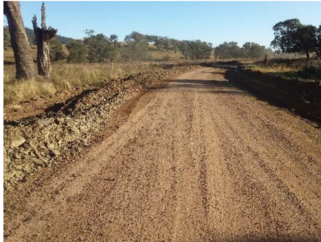
SR17 Back Creek Road, Gravel Resheeting

Work has commenced on a 2.5km section of Back Creek Rd between the properties Glenidle and Llangoland. There are several other areas along the road which will be repaired while the resheeting crew is in the area.