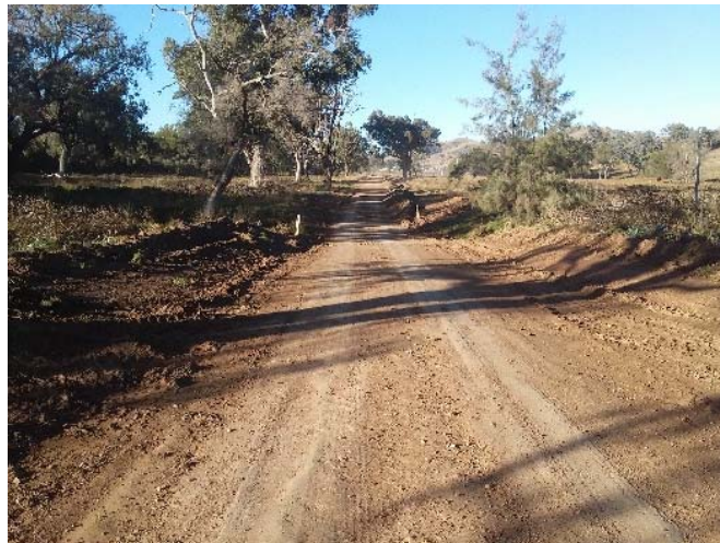
SR17 Back Creek Road, Gravel Resheeting