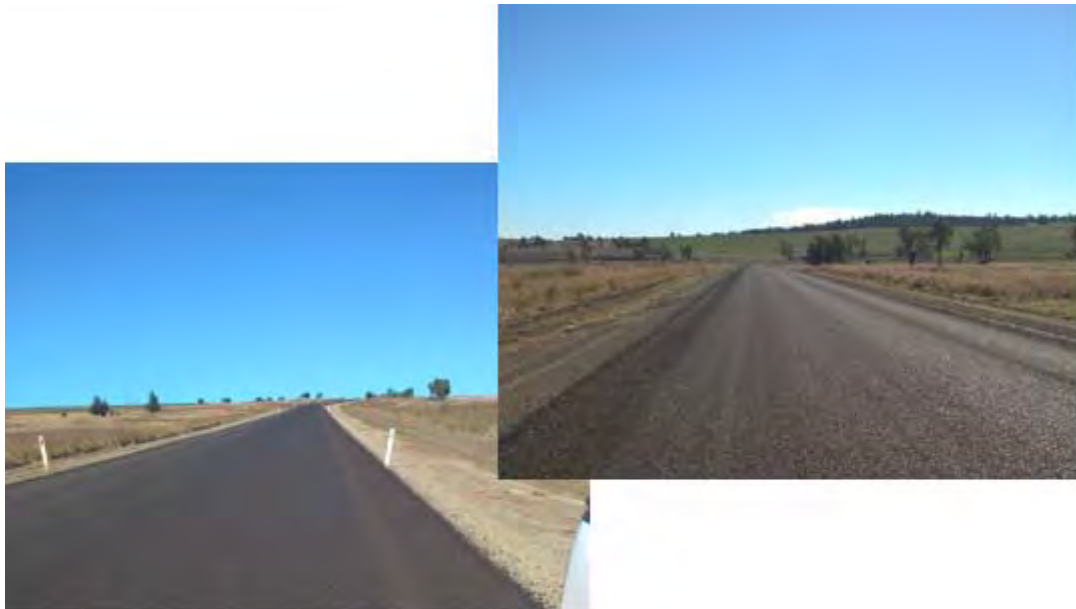
SR4 Baroma Downs Rehabilitation

Northern construction crews have now completed rehabilitation and heavy patching works on Baroma Downs Road. This has involved stabilising 2.5km of pavement with slag/lime and overlaying the existing pavement with 150mm of new material, also stabilised with a slag/lime product.