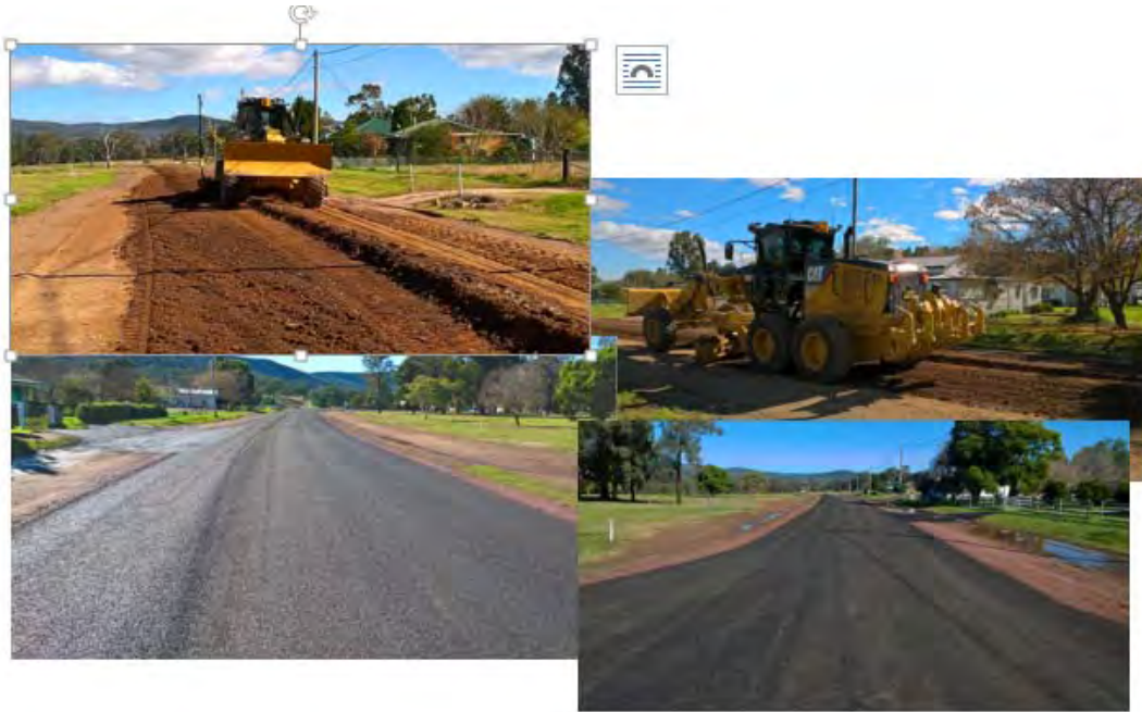
Realignment in White Street, Bingara

Northern construction crews have now completed rehabilitation and heavy patching works on Baroma Downs Road. This has involved stabilising 2.5km of pavement with slag/lime and overlaying the existing pavement with 150mm of new material, also stabilised with a slag/lime product.