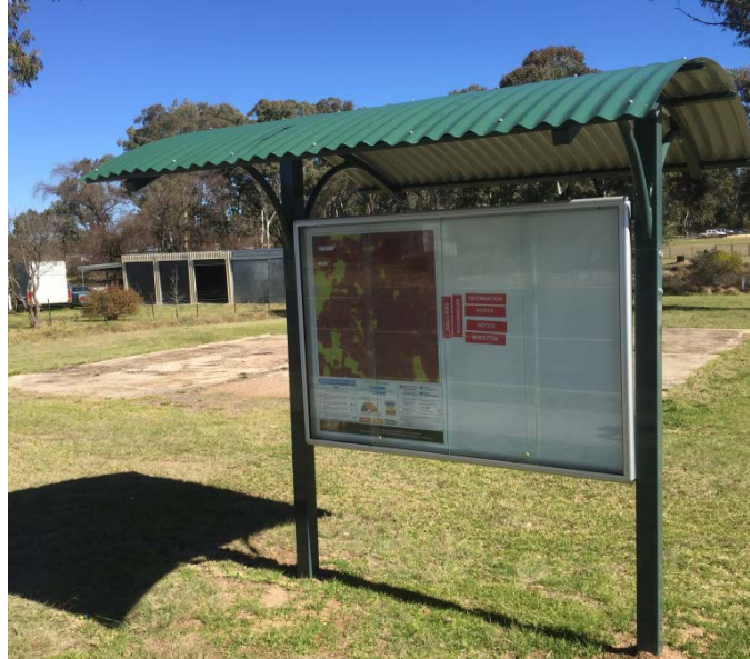
Example of shelter requested

Council has submitted a funding application to the Rural Fire Service for the installation of an information shelter, as shown in the picture below, to be erected in the main street of Warialda to display the Rural Fire Service Community Protection Plans as part of the Council/Rural Fire Service community consultation program regarding the risks of high fire zones.