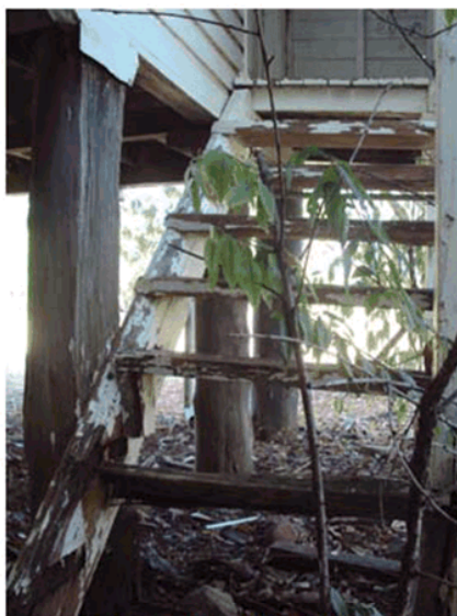
Deteriorated path of egress

There is no doubt whatsoever that the Gravesend Public Hall is repairable, but it is at a significant cost.