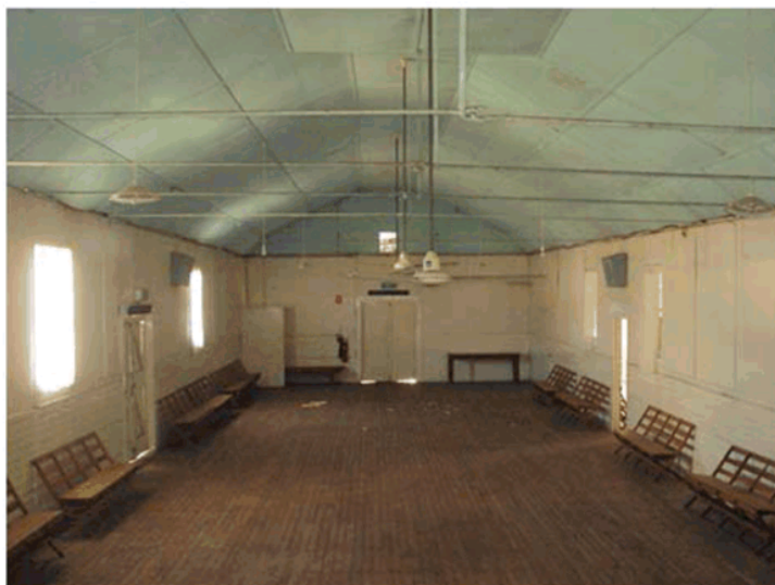
Inside the main hall building showing deteriorated state

The Gravesend Public Hall is not currently fit for use owing to its dilapidated state. There are a number of issues with the building including water leaks, loose lining material, unsafe electrical wiring and fixtures and non-complying exits which may pose a significant risk to occupants.