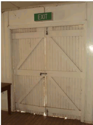
Emergency Exit door padbolted and without panic bars

Given the renewed enthusiasm and support from Gravesend residents and members of the surrounding community to retain the hall, it would seem that Council may consider not proceeding with the demolition of the hall and rather transfer ownership of the hall to a suitably formed Community Committee. By proceeding with this course of action, Council could remove the building and the resulting financial responsibility from their asset register and the Gravesend Community could retain their Hall.