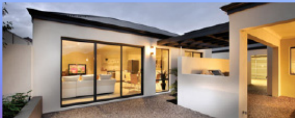
Studio Home Renovation

DBIS Pty Ltd PO BOX W 123 Parramatta Westfield NSW 2150 Phone 02 9687 9228 Fax: 02 9689 2229